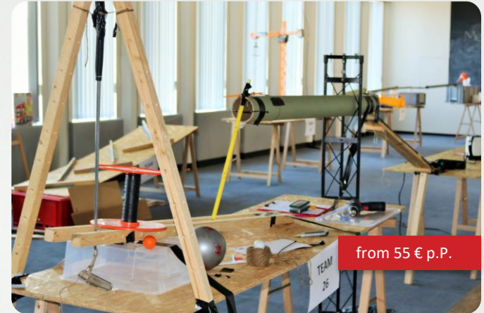
from 55 € p.P.

Your participants are first divided into teams and have the task of building various sections with different chain reactions. In addition to classic materials such as mousetraps, balloons, toys, cars, lots of wood and building materials, we also provide very curious objects such as fans, light barriers or alarm systems. This combination of different materials (we are also happy to integrate your products or services) stimulates the imagination of the participants to build the most original and imaginative reactions as a team. The big challenge for everyone is to trigger the individual impulses as effectively as possible and, above all, to pass them on smoothly to the neighboring team. This is the only way to create a chain reaction that is as uninterrupted and spectacular as possible. Lively and transferable one-to-one to everyday working life, this special concept initiates and strengthens the flow of communication across departments, locations or countries and the different skills of your participants guarantee overall success.